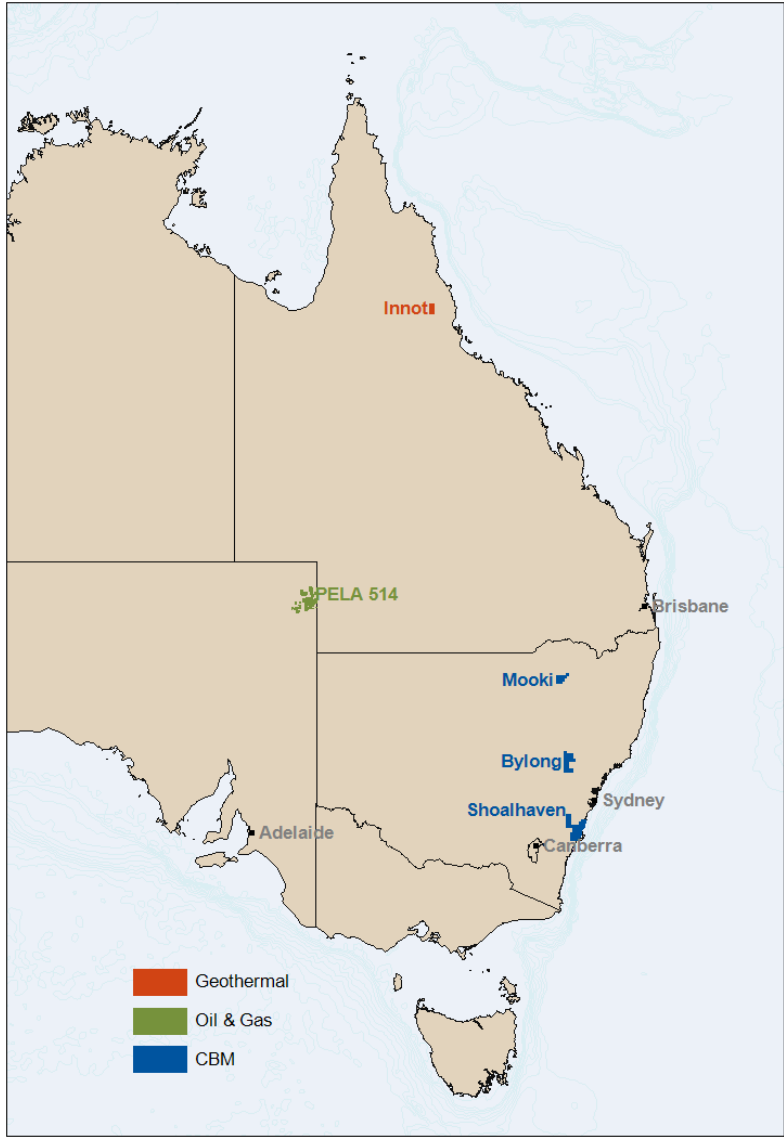
Tenement Location Map