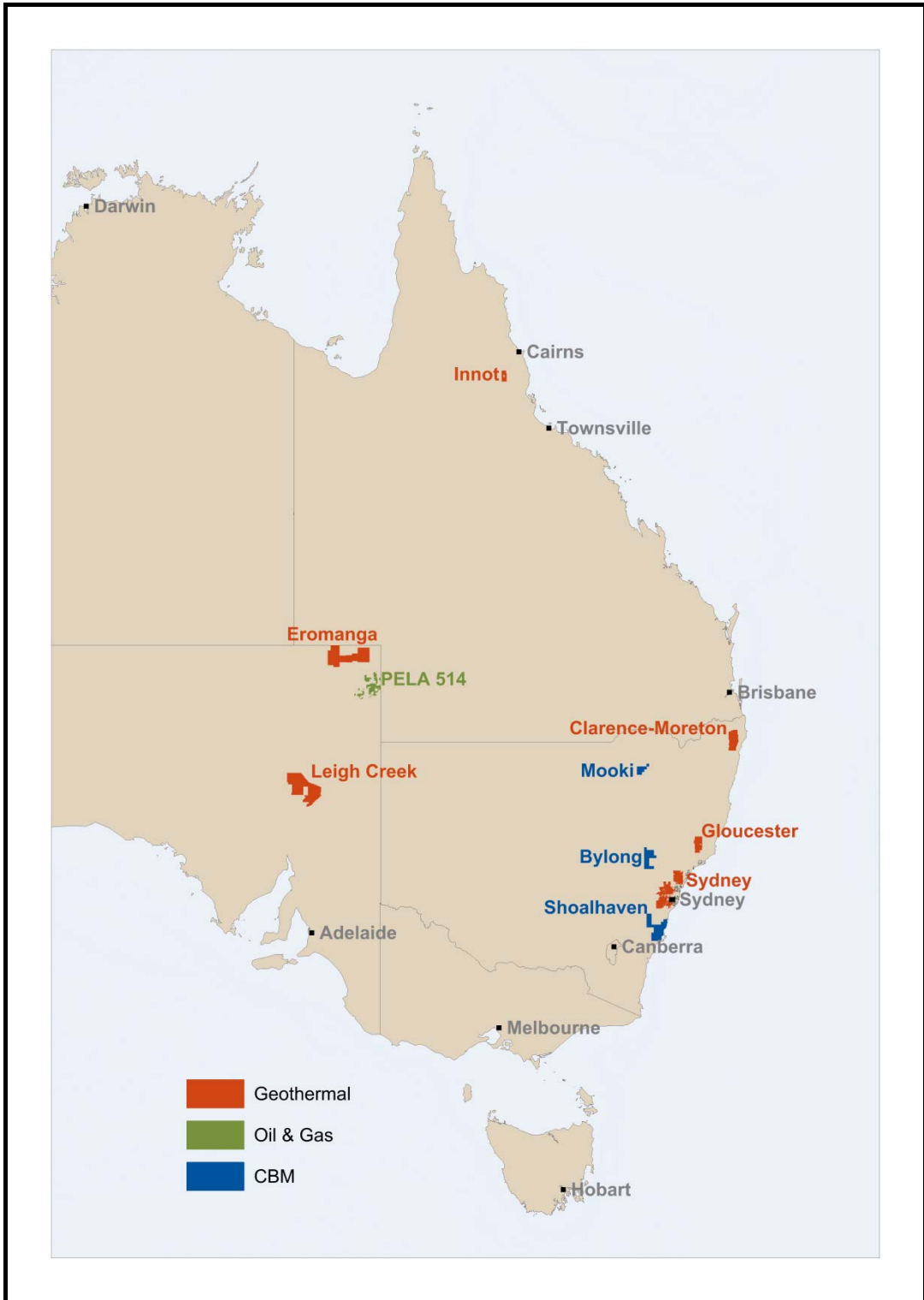
Location Map of the Australian Projects